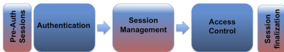
Figure 19.1.: Session Management Diagram

The session ID or token binds the user authentication credentials (in the form of a user session) to the user HTTP traffic and the appropriate access controls enforced by the web application. The complexity of these three components (authentication, session management, and access control) in modern web applications, plus the fact that its implementation and binding resides on the web developer's hands (as web development framework do not provide strict relationships between these modules), makes the implementation of a secure session management module very challenging. The disclosure, capture, prediction, brute force, or fixation of the session ID will lead to session hijacking (or sidejacking) attacks, where an attacker is able to fully